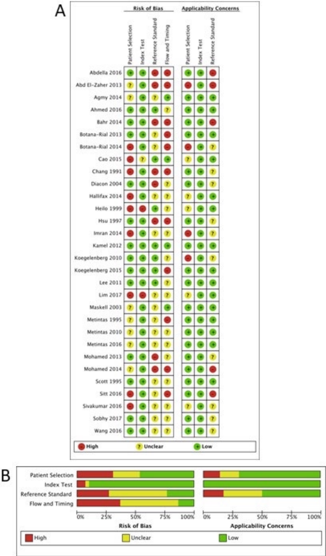
Fig. S1: Graphical display of the revised Quality Assessment of Diagnostic Accuracy Studies (QUADAS-2) results, according to risk of bias and applicability concerns (A) and overall (B)