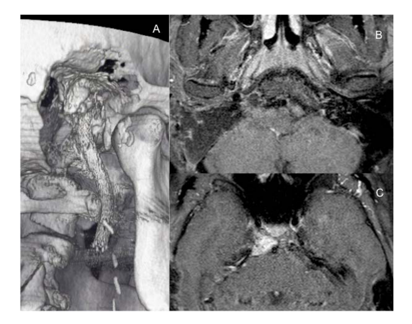
Suppl. fig. 1. Postoperative imaging of patient 4 (right C3Di4 TJP) after second stage surgery through a right transcochlear approach. A: 3D reformatted CT of the skull base demonstrating the large temporal craniotomy and the stent covering the right ICA from the distal cervical tract to the horizontal petrous segment. B: axial gadolinium enhanced MRI with fat suppression showing complete tumor removal from the petrous apex and around the intratemporal ICA. C: axial gadolinium enhanced MRI with fat suppression at a higher level displaying residual tumor in the right cavernous sinus.