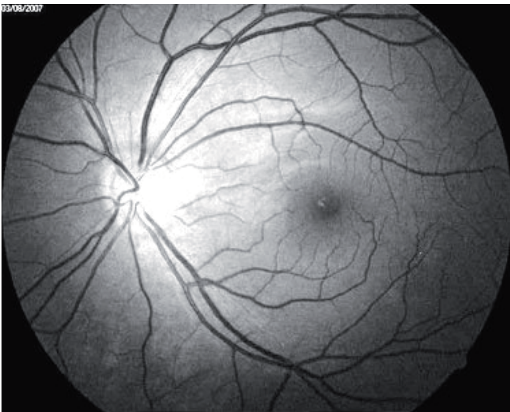
Figure 1a: CRVO in the right eye (fundus fluorescein angiography).

Figure 1b: Fundus fluorescein angiography of the left eye.