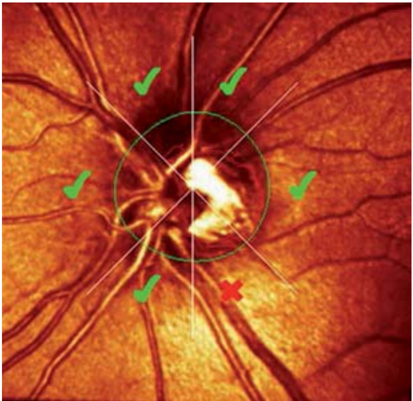
Figure 2a: Retinal tomography at the baseline (left eye).

Figure 2b: Retinal tomography after the 18 months of follow-up (left eye).